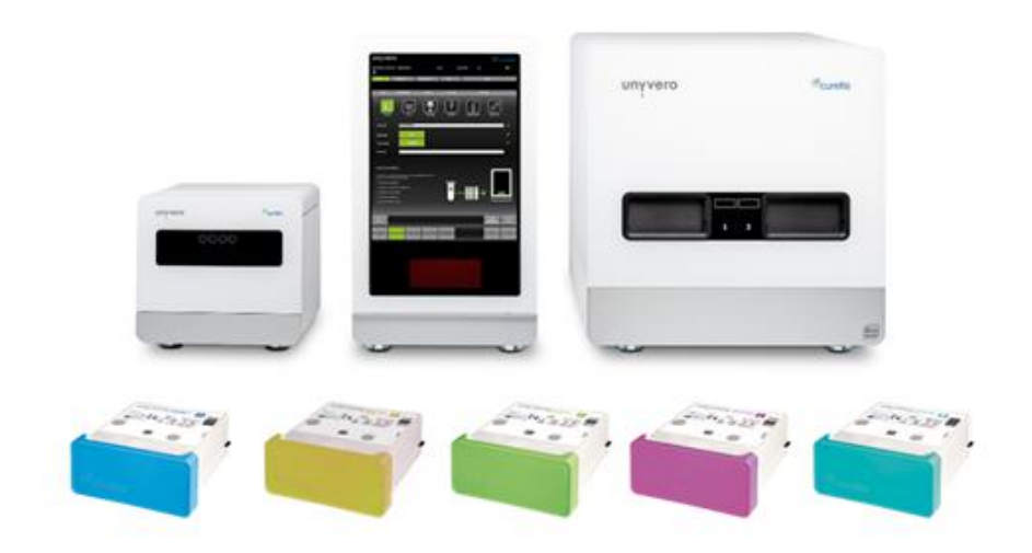
Figure 1: Unyvero A50 Platform

The Unyvero A50 System consists of three devices, the Unyvero L4 Lysator, the Unyvero C8 Cockpit and the Unyvero A50 Analyzer. The Unyvero L4 Lysator is used for sample pre-processing and pathogen lysis. The Unyvero C8 Cockpit is the control panel for the Unyvero L4 Lysator and Unyvero A50 Analyzer and displays the results of patient sample analysis. The Unyvero A50 Analyzer integrates mechanical, electronic, pneumatic and optical elements and enables a fully automatic random-access processing of the Application Cartridges. The Application Cartridges are single-use, disposable and disease specific. The Unyvero System, together with proprietary software and the Application Cartridges, comprise the Unyvero A50 Platform.