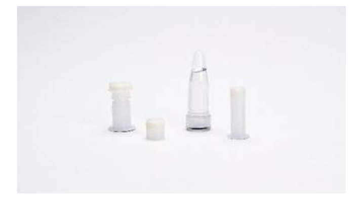
Figure 2: Unyvero sample tube, sample tube cap, sample pre-treatment tool and Master Mix tube

The Unyvero A50 Analyzer instrument consists of mechanical, electronic, pneumatic and optical elements and enables a fully-automatic random-access processing of the Application Cartridges. Once a run is started, the Unyvero A50 Analyzer automatically executes and controls all sample processing and analysis steps (including DNA extraction, DNA purification, PCR set-up, highly multiplexed end-point PCR amplification and a hybridization array-based fluorescence detection) inside the Application Cartridge. For safety and equipment longevity, and to avoid issues of calibration or waste-removal, the Unyvero A50 Analyzer contains neither reagents nor waste. All fluids are handled within the sealed Application Cartridge. Up to four Unyvero A50 Analyzers can be attached to a single Unyvero C8 Cockpit and each Unyvero A50 Analyzer includes the two available slots that provide full random access per Unyvero A50 Analyzer, allowing the processing of up to eight patient samples simultaneously within four to five hours. In the future, OpGen believes a further expansion to up to eight Unyvero A50 Analyzers will also be possible.