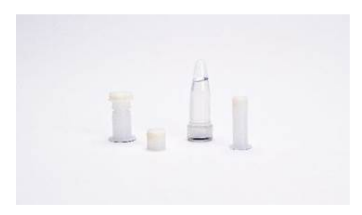
Figure 2: Unyvero sample tube, sample tube cap, sample pre-treatment tool and Master Mix tube

The Unyvero A50 Analyzer instrument consists of mechanical, electronic, pneumatic and optical elements and enables a fully-automatic random-access processing of the Application Cartridges. Once a run is started, the Unyvero A50 Analyzer automatically executes and controls all sample processing and analysis steps (including DNA extraction, DNA purification, PCR set-up, highly multiplexed end-point PCR amplification and a hybridization array-based fluorescence detection) inside the Application Cartridge. For safety and equipment longevity, and to avoid issues of calibration or waste-removal, the Unyvero A50 Analyzer contains neither reagents nor waste. All fluids are handled within the sealed Application Cartridge. Up to four Unyvero A50 Analyzers can be attached to a single Unyvero C8 Cockpit and each Unyvero A50 Analyzer includes the two available slots that provide full random access per Unyvero A50 Analyzer, allowing the processing of up to eight patient samples simultaneously within four to five hours. In the future, OpGen believes a further expansion to up to eight Unyvero A50 Analyzers will also be possible.