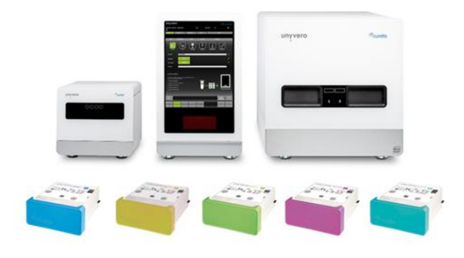
Figure 1: Unyvero A50 Platform

The Unyvero A50 System consists of three devices, the Unyvero L4 Lysator, the Unyvero C8 Cockpit and the Unyvero A50 Analyzer. The Unyvero L4 Lysator is used for sample pre-processing and pathogen lysis. The Unyvero C8 Cockpit is the control panel for the Unyvero L4 Lysator and Unyvero A50 Analyzer and displays the results of patient sample analysis. The Unyvero A50 Analyzer integrates mechanical, electronic, pneumatic and optical elements and enables a fully automatic random-access processing of the Application Cartridges. The Application Cartridges are single-use, disposable and disease specific. The Unyvero System, together with proprietary software and the Application Cartridges, comprise the Unyvero A50 Platform.