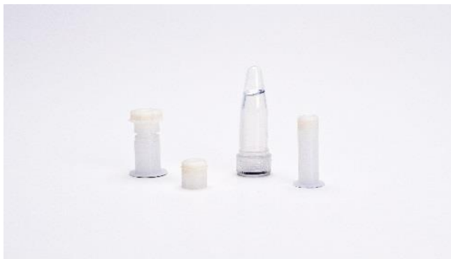
Figure 2: Unyvero sample tube, sample tube cap, sample pre-treatment tool and Master Mix tube

The Unyvero A50 Analyzer instrument consists of mechanical, electronic, pneumatic and optical elements and enables a fully-automatic random-access processing of the Application Cartridges. Once a run is started, the Unyvero A50 Analyzer automatically executes and controls all sample processing and analysis steps (including DNA extraction, DNA purification, PCR set-up, highly multiplexed end-point PCR amplification and a hybridization array-based fluorescence detection) inside the Application Cartridge. For safety and equipment longevity, and to avoid issues of calibration or waste-removal, the Unyvero A50 Analyzer contains neither reagents nor waste. All fluids are handled within the sealed Application Cartridge. Up to four Unyvero A50 Analyzers can be attached to a single Unyvero C8 Cockpit and each Unyvero A50 Analyzer includes the two available slots that provide full random access per Unyvero A50 Analyzer, allowing the processing of up to eight patient samples simultaneously within four to five hours. In the future, OpGen believes a further expansion to up to eight Unyvero A50 Analyzers will also be possible.