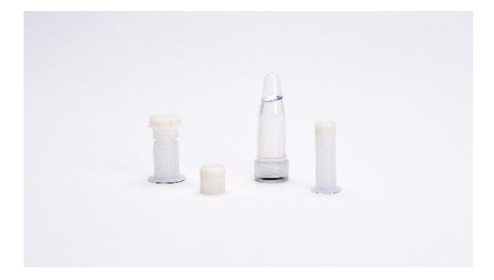
Figure 2: Unyvero sample tube, sample tube cap, sample pre-treatment tool and Master Mix tube

The Uyvero A50 Analyzer instrument consists of mechanical, electronic, pneumatic and optical elements and enables a fully-automatic random-access processing of the Application Cartridges. Once a run is started, the Unyvero A50 Analyzer automatically executes and controls all sample processing and analysis steps (including DNA extraction, DNA purification, PCR set-up, highly multiplexed end-point PCR amplification and a hybridization array-based fluorescence detection) inside the Application Cartridge. For safety and equipment longevity, and to avoid issues of calibration or waste-removal, the Unyvero A50 Analyzer contains neither reagents nor waste. All fluids are handled within the sealed Application Cartridge. Up to four Unyvero A50 Analyzers can be attached to a single Unyvero C8 Cockpit and each Unyvero A50 Analyzer includes the two available slots that provide full random access per Unyvero A50 Analyzer, allowing the processing of up to eight patient samples simultaneously within four to five hours. In the future, OpGen believes a further expansion to up to eight Unyvero A50 Analyzers will also be possible.